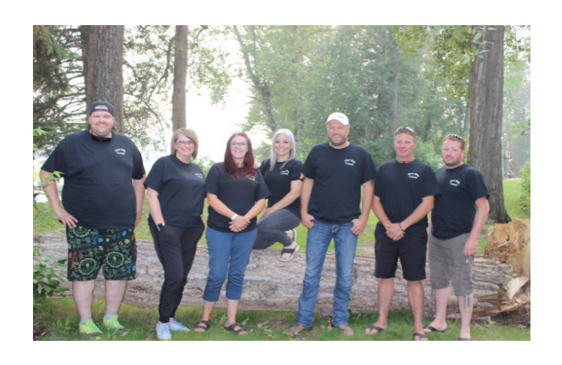
We Stand Together ~ Wildfire 2023